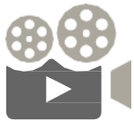
Media & Entertainment