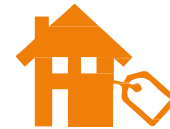
Construction & Real Estate