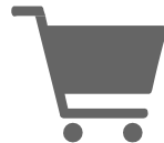
Retail & E-Commerce