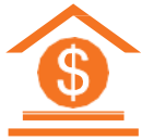
Banking & Financial services