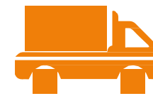
Logistics & Transportation